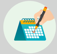
Exhibit Hall Dates & Times

Our goal is to help our exhibitors to be successful, and we invite you to participate!